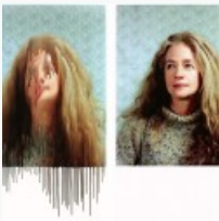
Not Photoshop: Trippy Melting Inkjet Prints