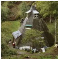
Earthy European Dwellings Go Off the Grid

355 Newport Blvd. Newport Beach CA 926 hello@visualnews.com