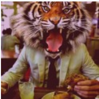
Visual Bits #232> Life Is Full Of Laughter