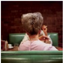
Visual Bits #402 > In The Eyes Of A Photographer